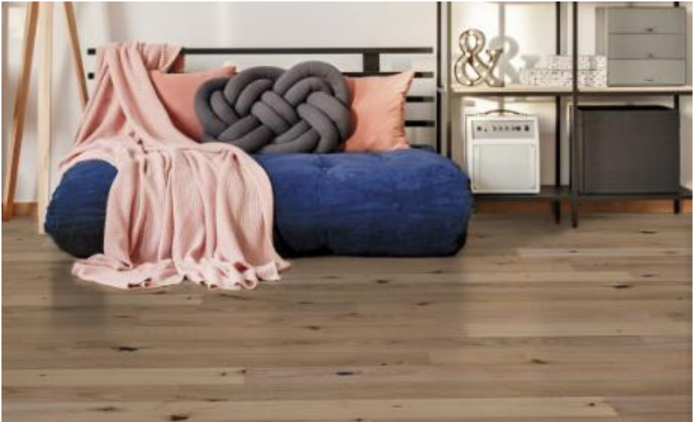
ADEF/IN05 Ship Deck Oak