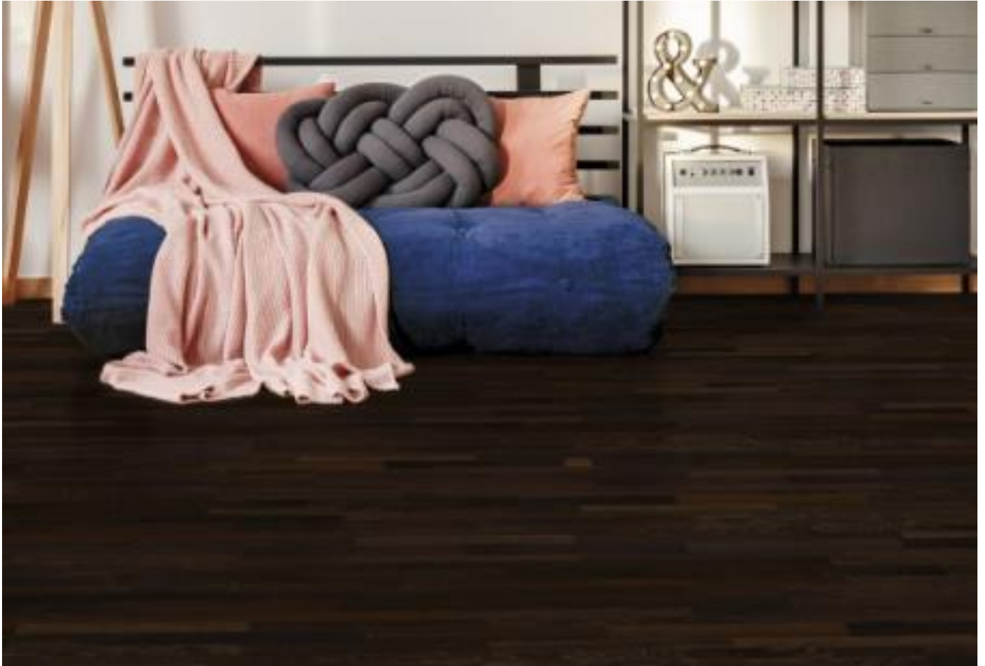
ADEF/IN07 Smoked Oak