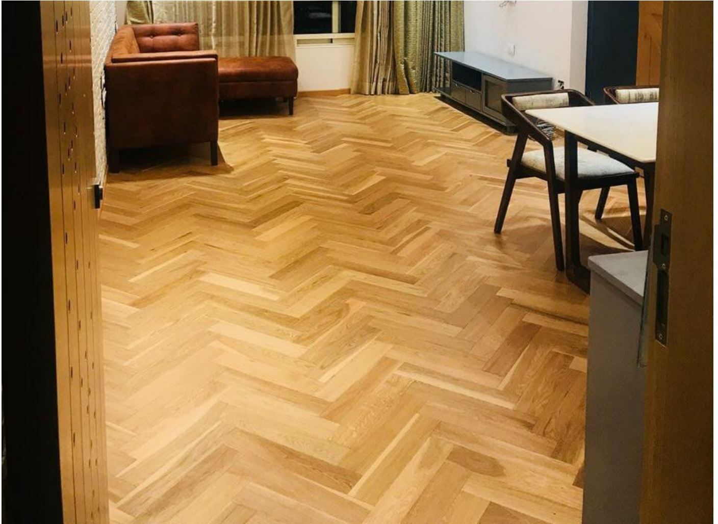
ADEF/IN11 Natural Oak