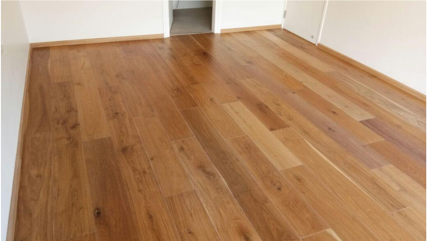
ADEF/IN08 Oak Natural