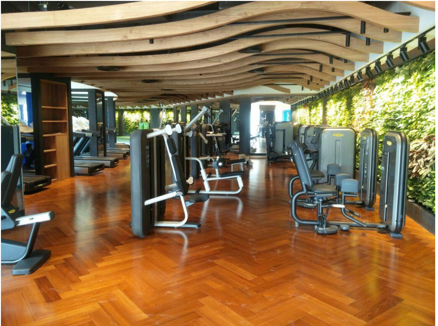
ADEF/IN09 Burmese Teak