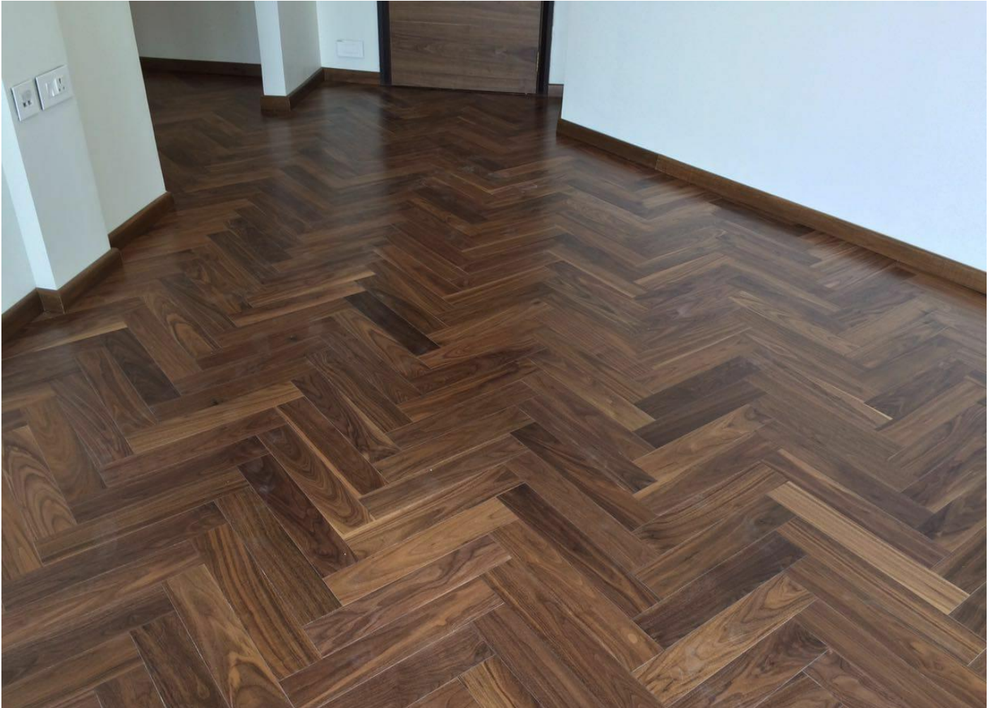
ADEF/IN10 Prestige Walnut